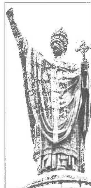
Pope Urban II

In addition, this perception shared by these Muslim fundamentalists