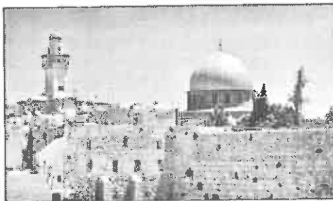
Dome of the Rock

assumed control of the remains of the Byzantine Empire (Eastern Roman Empire) as Emperor Alexius I. It was at the Council of Clermont, November 1095 C.E., that Pope Urban called upon Western Christians to help the Byzantines reconquer the Holy Land from Islamic dominance. It was met with a great outpouring of support from all classes of the population who were willing to go and fight the Muslims with and for the sign of the cross.