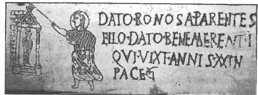
An early depiction of the resurrection of Lazarus

When Jesus raised Lazarus from the dead and called him out of the